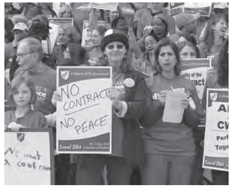
TCNJ Day of Action

In April, 2012 there was a day of action. Over 1,000 faculty, professional staff, librarians, adjuncts and students, CWA and IFPTE members, State assembly members and the NJ-AFLCIO, held demonstrations on April 25 and 26. At eight campuses represented by